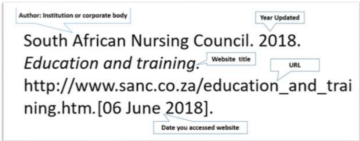
Figure 4 (Vajat, 2018)