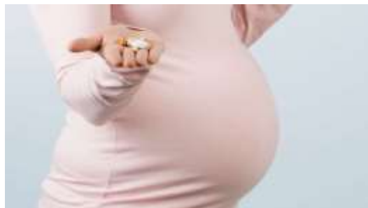
Figure 5 (Alam, 2018)