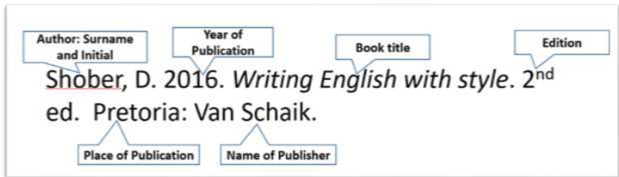
Figure 2 (Vajat, 2018)

Author/s: refers to the person/ institution or corporate body who is responsible for the intellectual and artistic content of an information source. For a person it will be Surname, Initials. E.g. Shober, D.